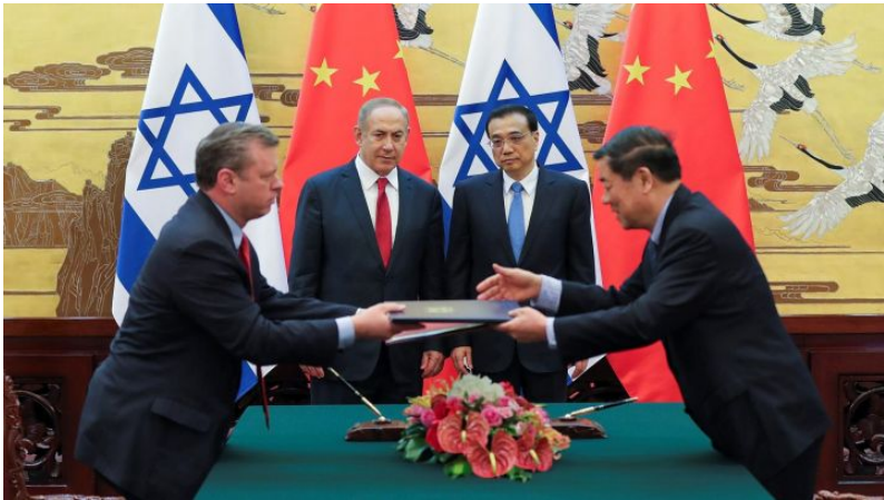
Chinese Premier Li Keqiang with Israel Prime Minister Benjamin Netanyahu attend a signing ceremony at the Great Hall of the People in Beijing, China, on Monday.

Share | Tweet | | | | 0 | Zen | Subscribe